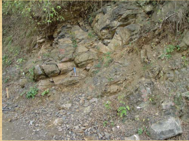
graptolites; and the middle-upper Ordovician shales that

yield very abundant and exquisite 3-dimensional pyritic graptolites and interlayered limestones; and the thick Upper Ordovician 'flysch' deposits containing brachiopods and trilobites, and simultaneous platform carbonates on which coral and stromatoporoid reefs flourished.